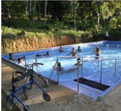
Our therapeutical pool.