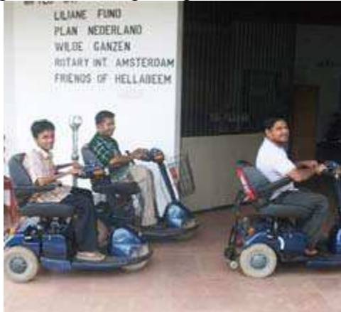
3 disabled teachers in Hellabeem

Much has happened since the last newsletter in May. Our boys are doing fine and they do their best. Unfortunately one of the boys has broken his pelvis because of a fall, but we are glad that he is getting better now. At the moment he is living at home.